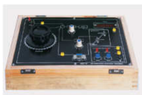
DC Position Control Trainer