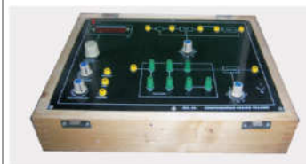
Compensation Trainer Kit