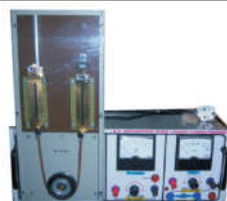
DC Servo Motor Trainer