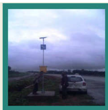
Emergency Calling System for National Highways