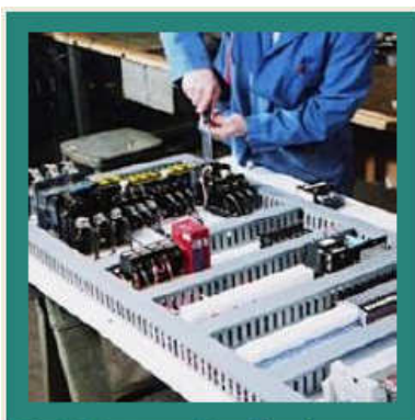
PLC System Designing