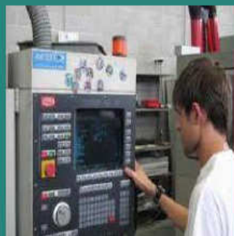
PLC Programming and Services