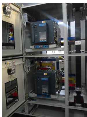
Air Circuit Breaker panels