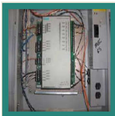
HVAC Electrical Panel