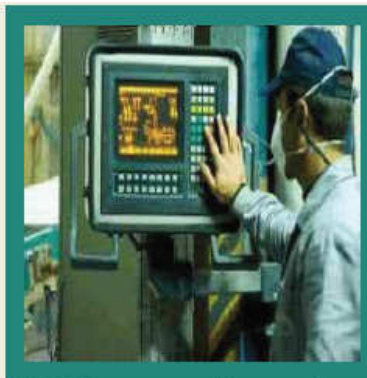
HMI Programming and Services