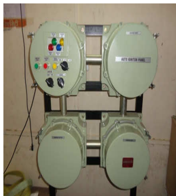
Auto Injection Panel