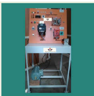
Stepper Drives/Motors Training Kit