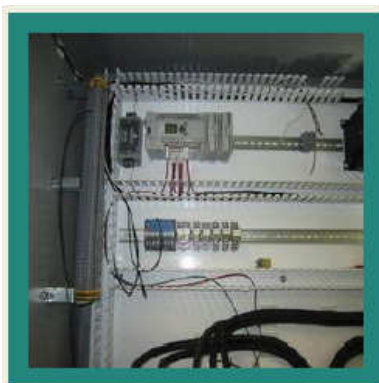
PLC Panel Wiring