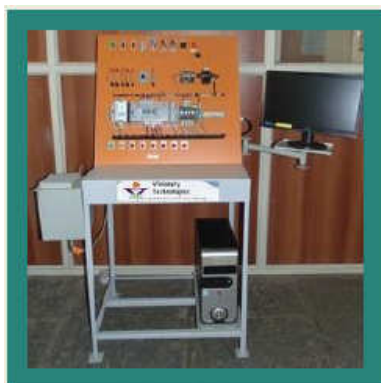
PLC Training kit