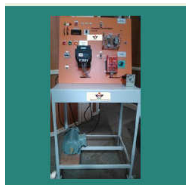
Industrial Drives training Kit