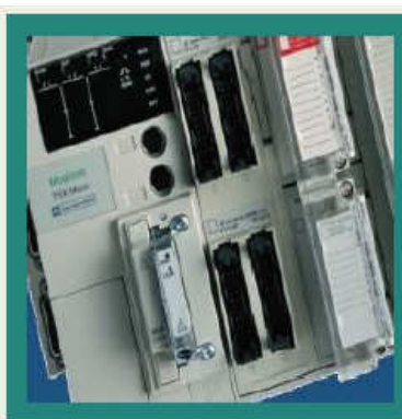
PLC & SCADA Logic Freelancing