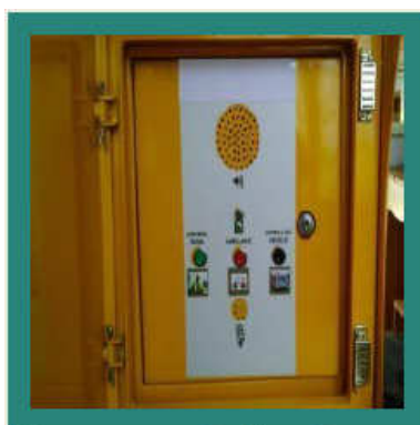
Emergency Calling System SOS