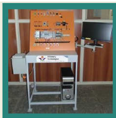
SCADA Training Kit